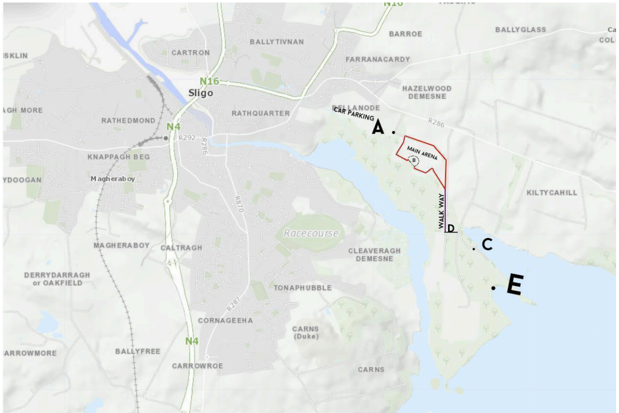
Figure 2.0 - Map of Hazelwood including Half Moon Bay